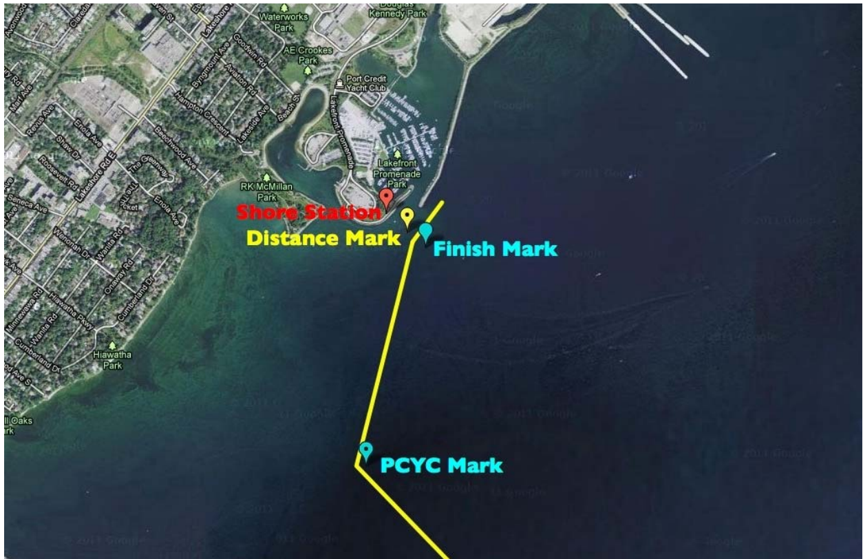
Diagram 2 The Finish

After the first warning signal for a race and prior to her warning signal, a sailboat shall keep clear of the starting area that extends one-quarter of the length of the starting line ahead of and behind the starting line. It shall also extend one-quarter of the length of the starting line past either end of the starting line